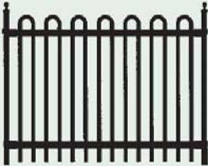
ROYAL EAGLE II